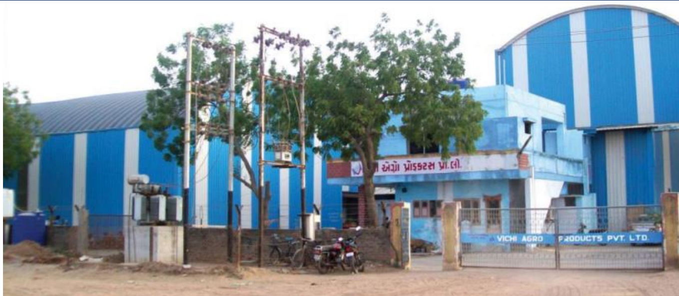
Milling facility at Khambhat Gujarat