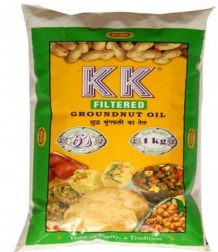
K.K. Groundnut Oil